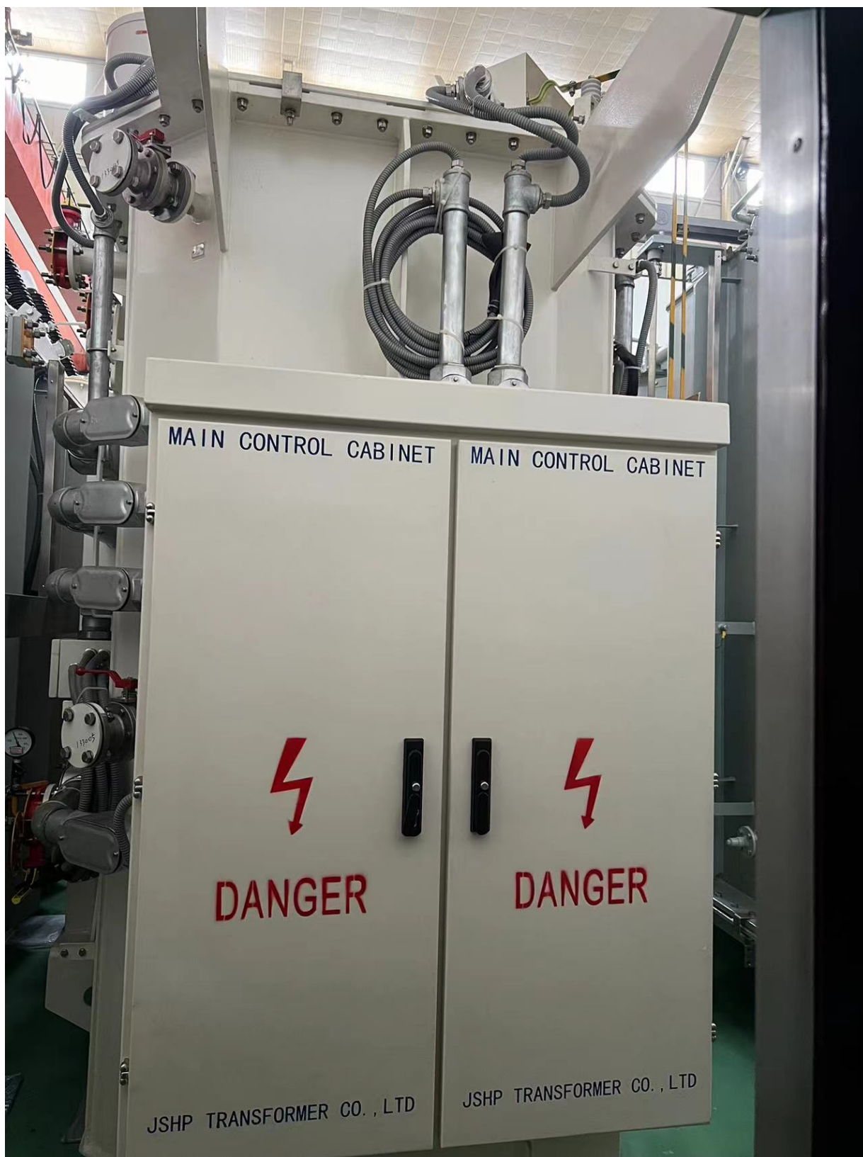
Figure 5: Storage status 5