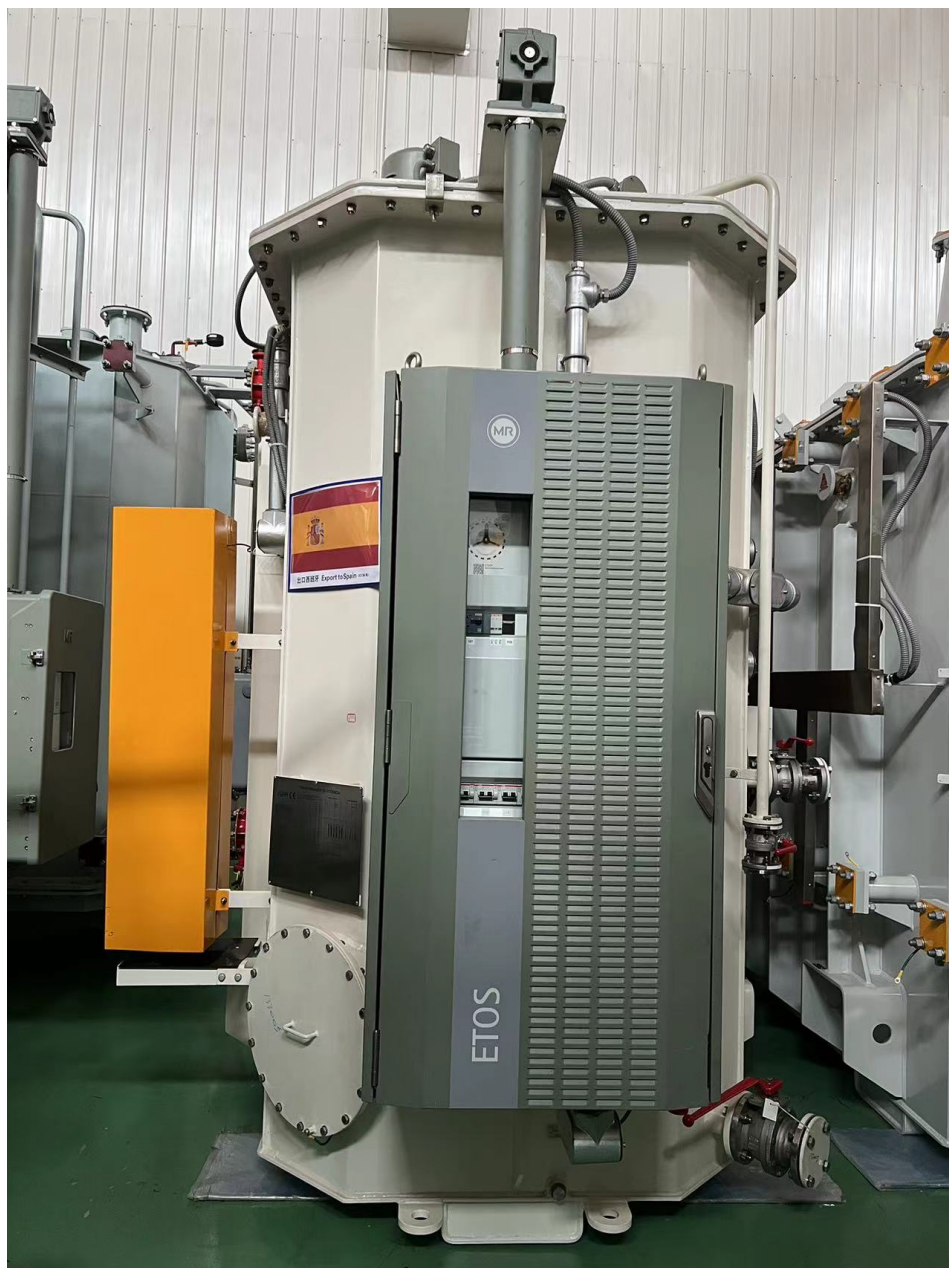
Figure 2: Storage status 2