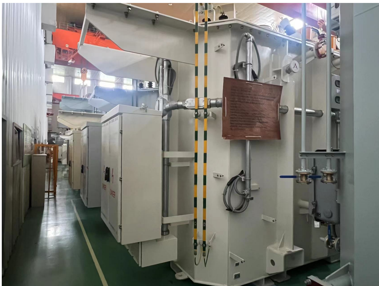
Figure 1: Storage status 1