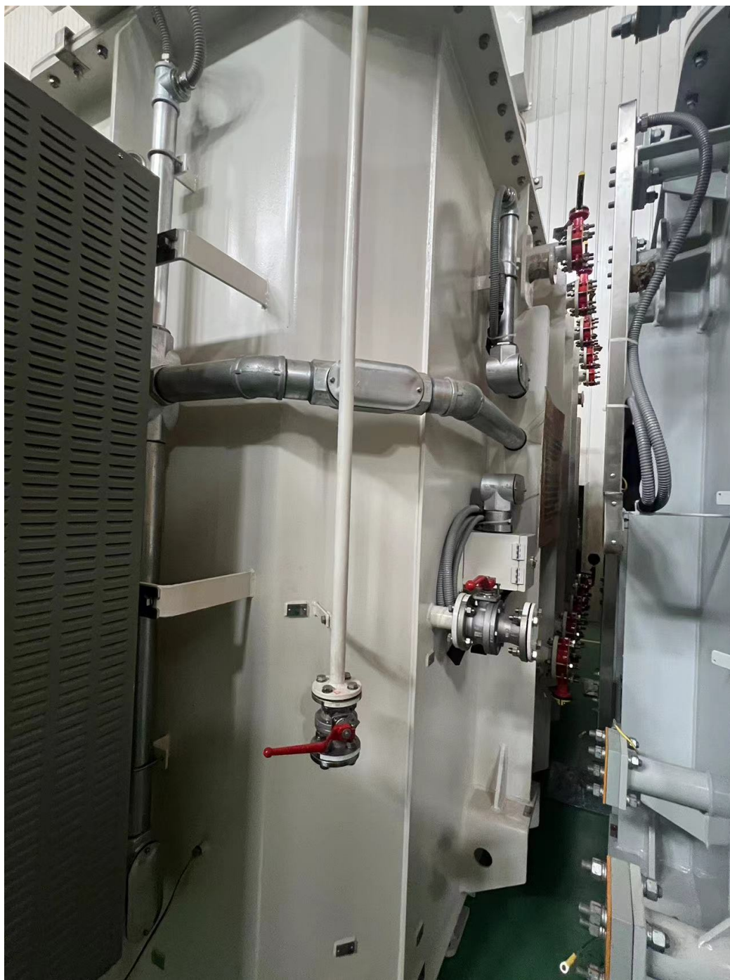
Figure 3: Storage status 3